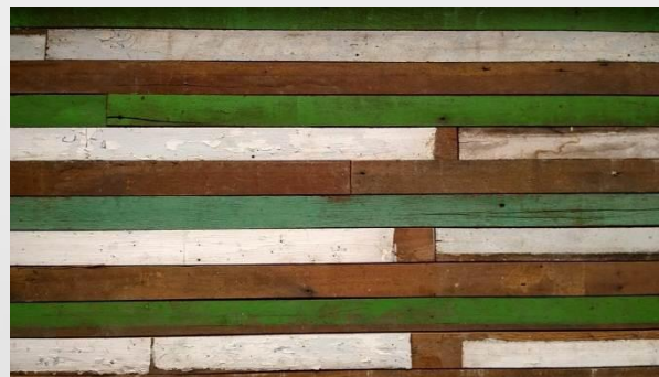
WOOD is sturdy and flexible

https://commons.wikimedia.org/wiki/File:Concrete_texture.jpg