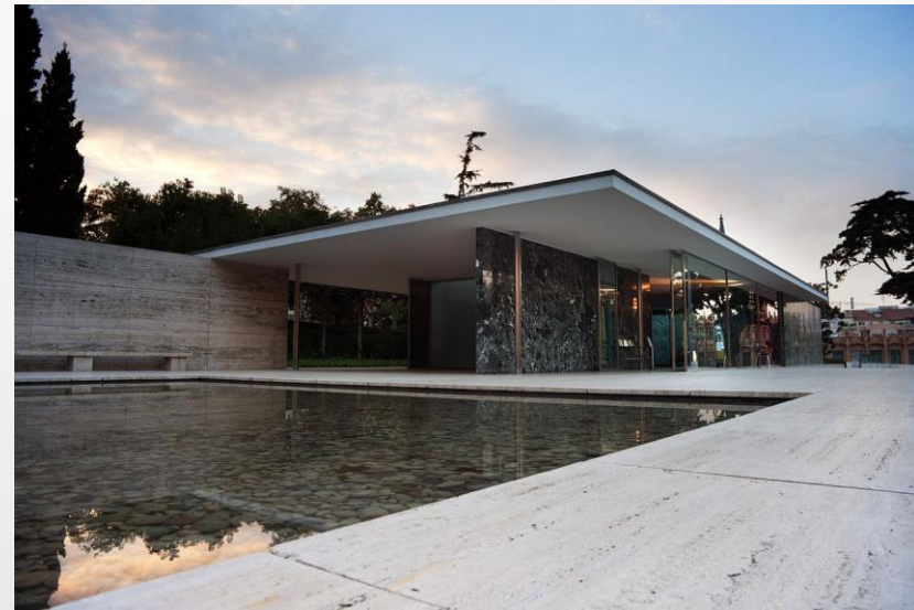
Exposed spaces of Barcelona pavilion