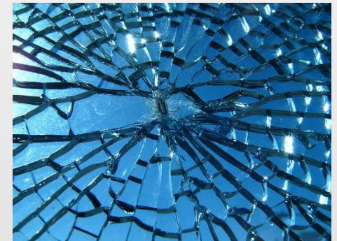
GLASS is transparent and allows light to filter in.