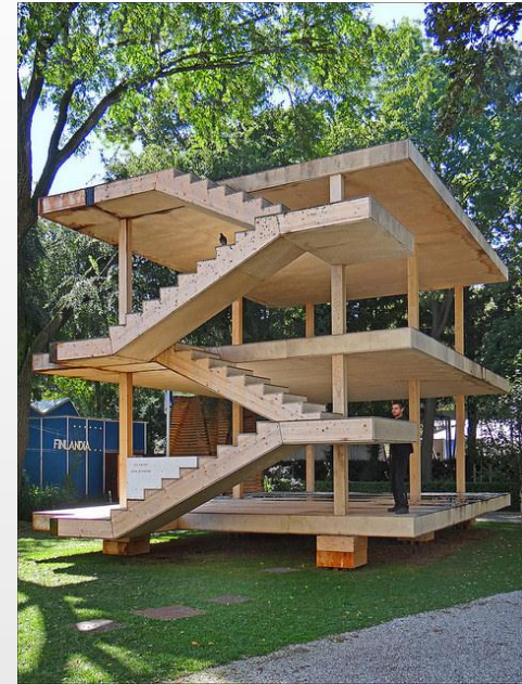
Skeleton of a house to be mass-produced of inexpensive, standardized materials

https://www.flickr.com/photos/dalbera/14938729273