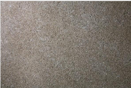
CONCRETE is fluid

https://commons.wikimedia.org/wiki/File:Concrete_texture.jpg