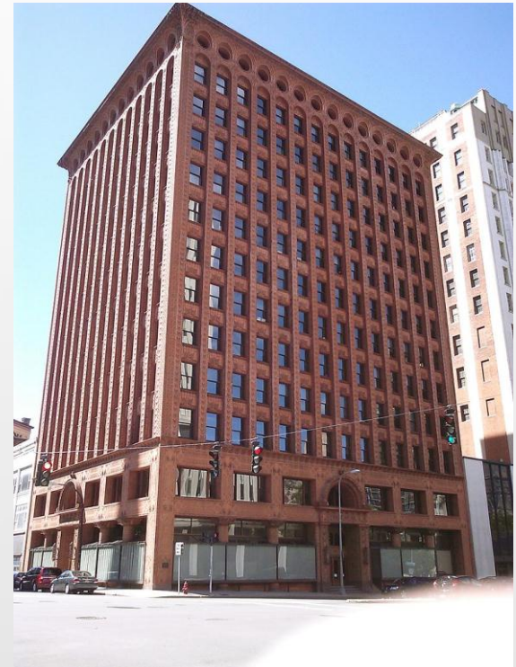
The Wainwright Building (1890)